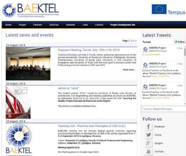
Figure 1: BAEKTEL website

However, application and development of OER materials faces certain difficulties. Some of the issues are how to secure the quality of OER content, and how to sustain long-term interest for development of OER materials. Thus Koppi and Lavitt [9] state that one of the reasons for the lack of motivation among the teaching staff regarding OER development can be found in absence of institutional valuation. Hence they suggest that appropriate credits should be awarded for contribution to OER development. Having in mind all the advantages of OER materials, as well as the need to make free educational content available, a number of Western Balkans and EU universities gathered around the idea of creating BAEKTEL project (Blending Academic and Entrepreneurial Knowledge in Technology Enhanced Learning). Universities from Serbia, Montenegro, Bosnia and Herzegovina, Italy, Slovenia and Romania are taking part in this project (www.baektel.eu - Figure 1). The aim of the project is to create OER materials in different areas which will create a connection between university knowledge (theoretical knowledge) and practical (applied) knowledge needed for working in the industry. To that end, educational materials in electronic form will be created, which will be publically available at no cost to the end user. In this task all advantages of information technologies will be used in order to present materials in a meaningful way, by satisfying basic pedagogical-didactic criteria.