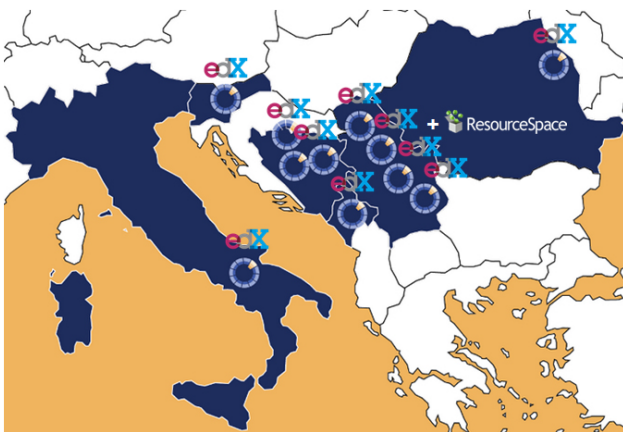
Figure 4: Distribution of BAEKTEL resources

As mentioned earlier, for a richer user experience, it was important to use the most interactive and the most user friendly learning platform. After examining the most popular learning platforms, we found that edX platform ( http://code.edx.org/ ) created by MIT offers by far the richest and most interactive user experience, compared to the other two most popular open source learning platforms (OpenMOOC and Moodle). Hence a network of edX nodes spread throughout partner countries, together with the ResourceSpace platform form the core of the BAEKTEL framework, as depicted in Figure 4.