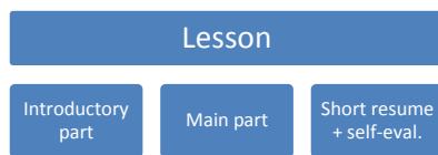
Figure 3: Structure of a lesson

When it comes to the structure of a single lesson, it is recommendable to divide each lesson into three basic parts (Figure 3). In the introductory part of the lesson it is desirable to create motivational examples and tasks that will introduce the content of the lesson to the end user while awakening interest at the same time. The main part of the lesson follows, consisting of the largest part of the planned content, in accordance with the didactic principle of science, which will be elaborated below. Finally, the third part of the lesson should preferably contain a short resume as well as some kind of self-evaluation consisting of short questions and quizzes.